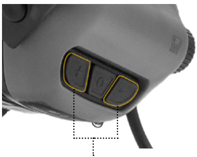
Press the volume "+" and "-' buttons to switch between five mission scene modes: